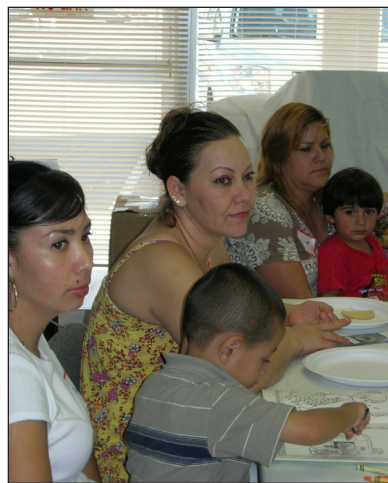
Focus group participants provided insight to improve our state's immunization rates.

Most participants conveyed it was an emotional experience when their child was vaccinated. For most parents, the need to receive multiple shots at the same visit was upsetting. Some